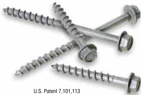
U.S. Patent 7,101,113